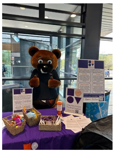
On Tuesday 18<sup>th</sup> April, our Learning4Life Halton group held their own open day at our Runcorn venue. Well done to all for organising the day and promoting the work we do to support and advise adults who have received a recent diagnosis of autism.

Over the next few months, we have lots of activities planned so make sure to look out for us at the following events: